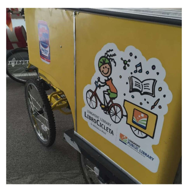
17: Longmont Public Library Bike Outreach.