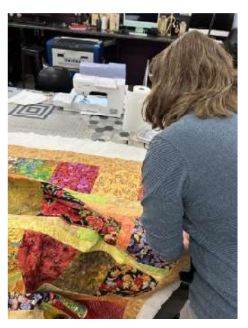
18: Community quilt making at Estes